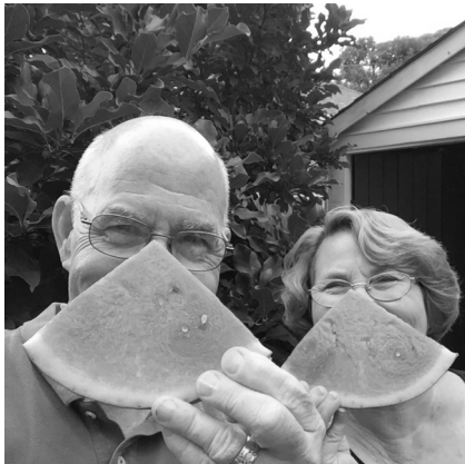
The 83rd Street Interlopers show off their watermelon slices to complete a week 2 mission.

Imprint Digital Printing & Design Corp, Tosa Insurance Agency, Full Service Car Wash, Hallman Lindsay Paints, Drunken Cobra, Tosa Block Party, BB's Pizza, Bublr Bikes, Johnson's Cycle and Fitness, Alfa Flower, Fresh Fin Poke, Galbraith Carnahan Architects, Cafe Blue, Fancy Pants Pet Salon, MeKong Café, Tosa Bowl and Bun, Body Renovation Physical Therapy, McDonalds on North, Beyer Chiropractor, Tosa Yoga, Wauwatiki Bar and Grill and Fermentorium Barrel House.