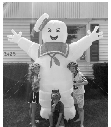
It wasn't yet Halloween, but teams had fun finding the house this guy was haunting.

Teams varied from singles to couples, from families to friends – with all ages represented! Over the course of four separate one-week hunts, there were 143 different missions available. Each team logged into the TETNA hunt on the GooseChase app from which they submitted photos to show the missions they accomplished. In total, teams submitted an amazing 3,082 mission pictures as they hunted down locations, created works of art, shared treats with neighbors, solved puzzles and more.